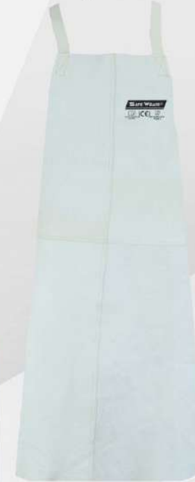
Art SW:1250 Welding Apron 78x104cm