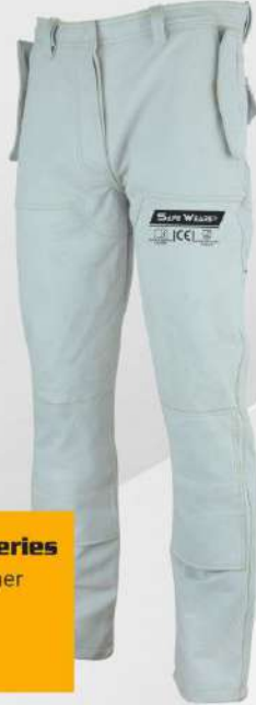
Art SW:1250 Welding Pant