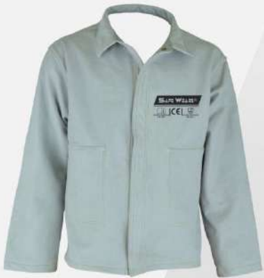
Art SW:1250 Welding Jacket

CE CAT II EN ISO 13688:2013 +A1:2021 EU:2016/425 (0493 CENTEXBEL BELGIUM) CE EN ISO 11611:2015 AI Class 1