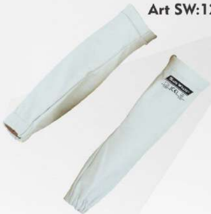
Art SW:1250 Welding Sleeve Short