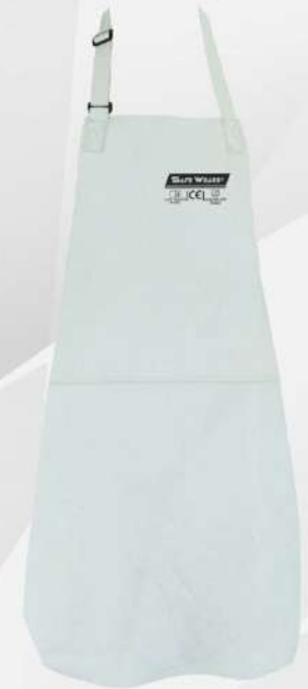
Art SW:1250 Welding Apron 60x90cm