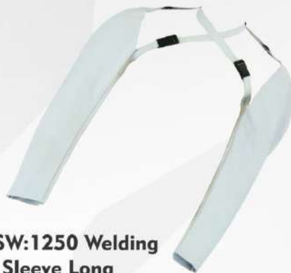
Art SW:1250 Welding Sleeve Long