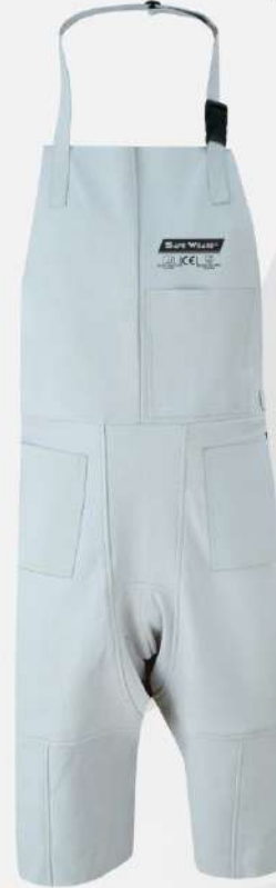
Art SW:1250 Welding Bib Short

CE CAT II EN ISO 13688:2013 +A1:2021 EU:2016/425 (0493 CENTEXBEL BELGIUM) CE EN ISO 11611:2015 AI Class 1