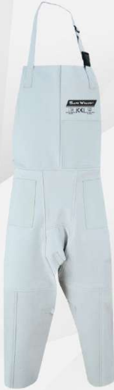
Art SW:1250 Welding Bib Long