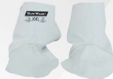
Art SW:1250 Welding Shoe Cover Short